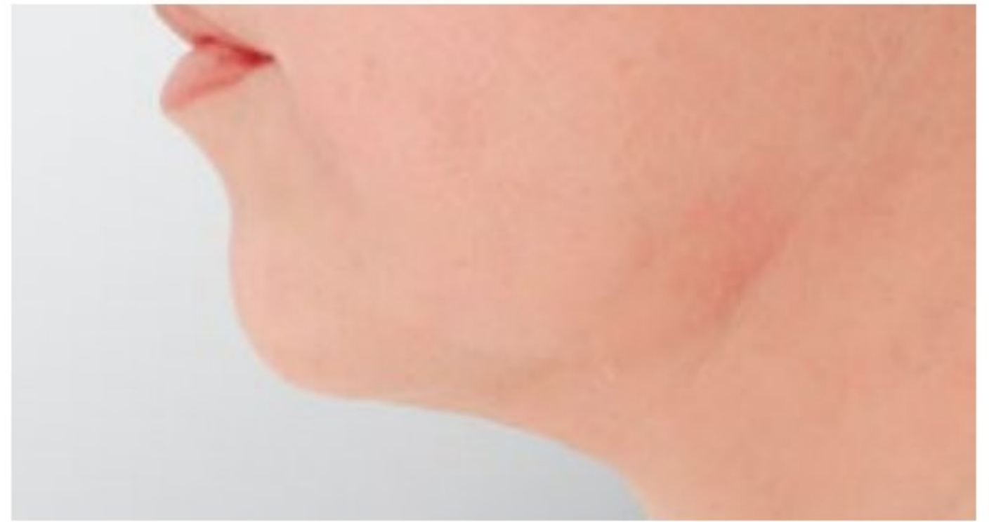
MANDIBULAR CONTOUR before/after