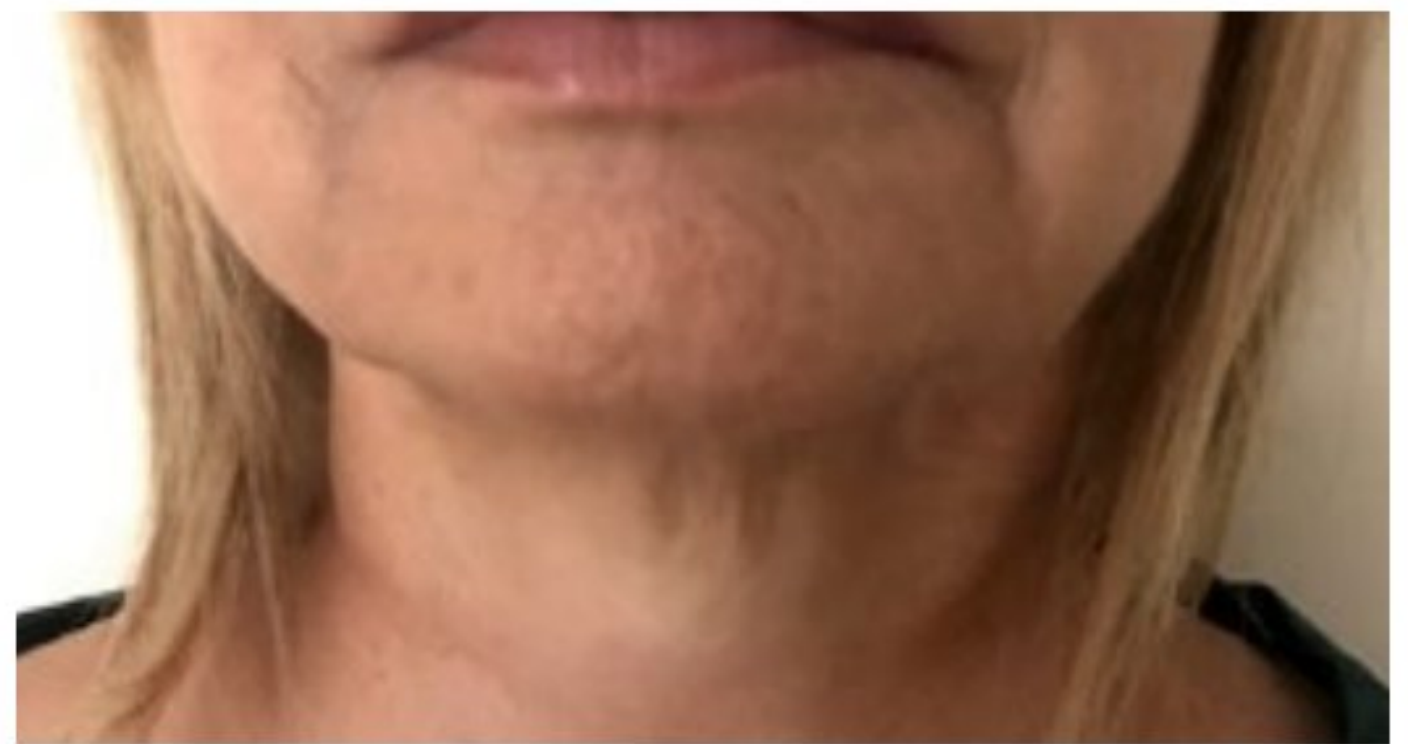
LOWER MIDDLE THIRD OF THE FACE before/after