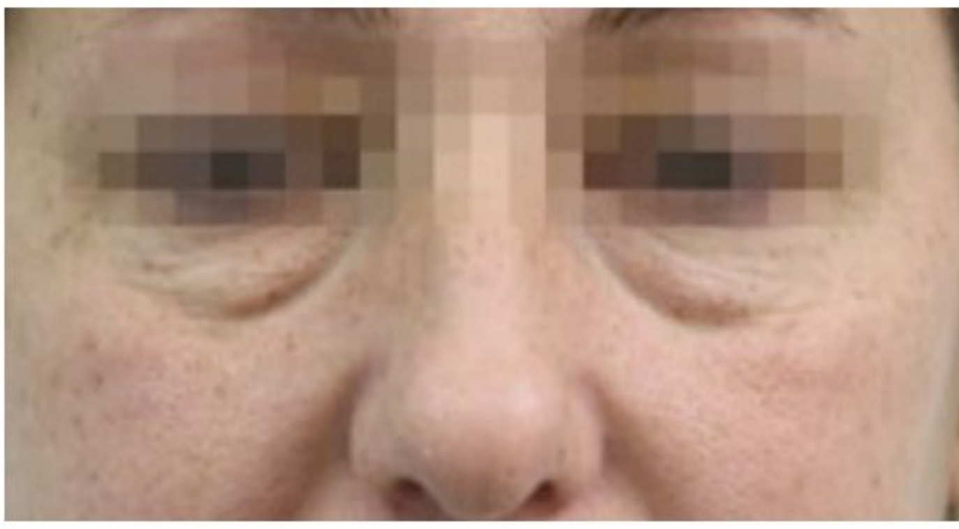
LOWER EYELID before/after