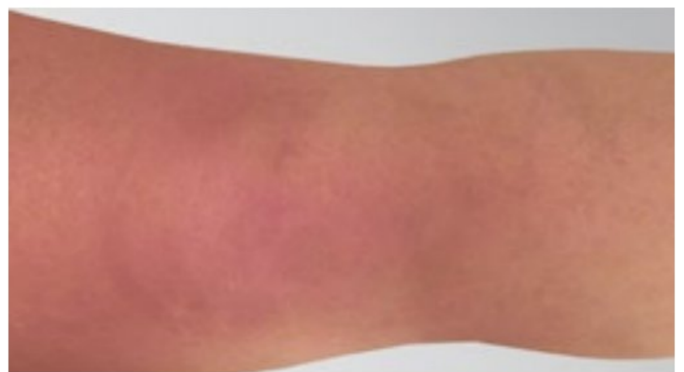
INNER THIGH before/after